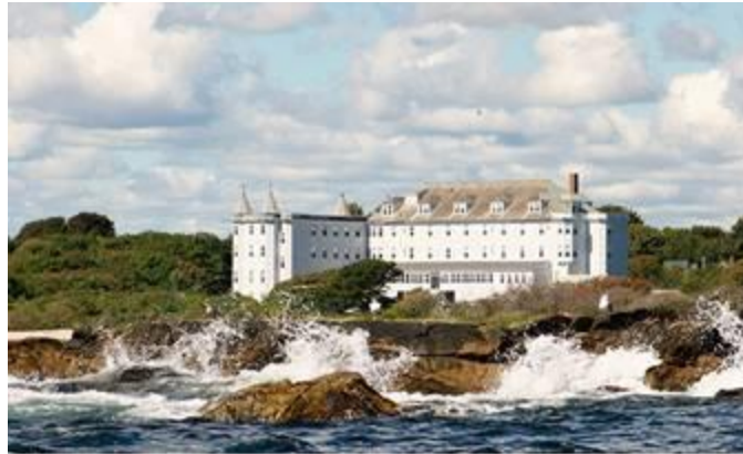
Marie Joseph Spiritual Center in Biddeford, Maine