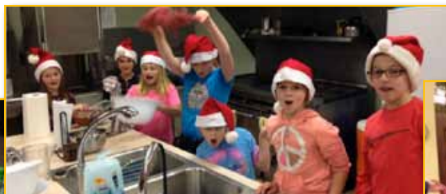
A few recent images of God's Kitchen Crew demonstrating what they do best!