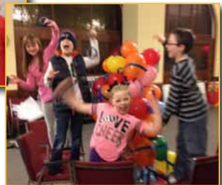
A few recent images of God's Kitchen Crew demonstrating what they do best!