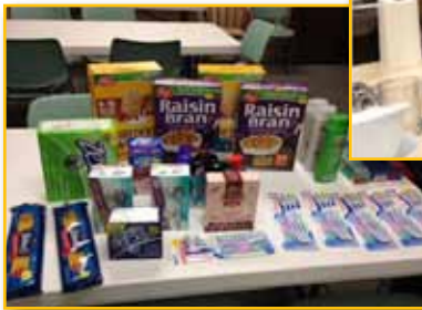
Food and toiletries purchased by the Youth Group on Jan. 10th for Mt. Blue students